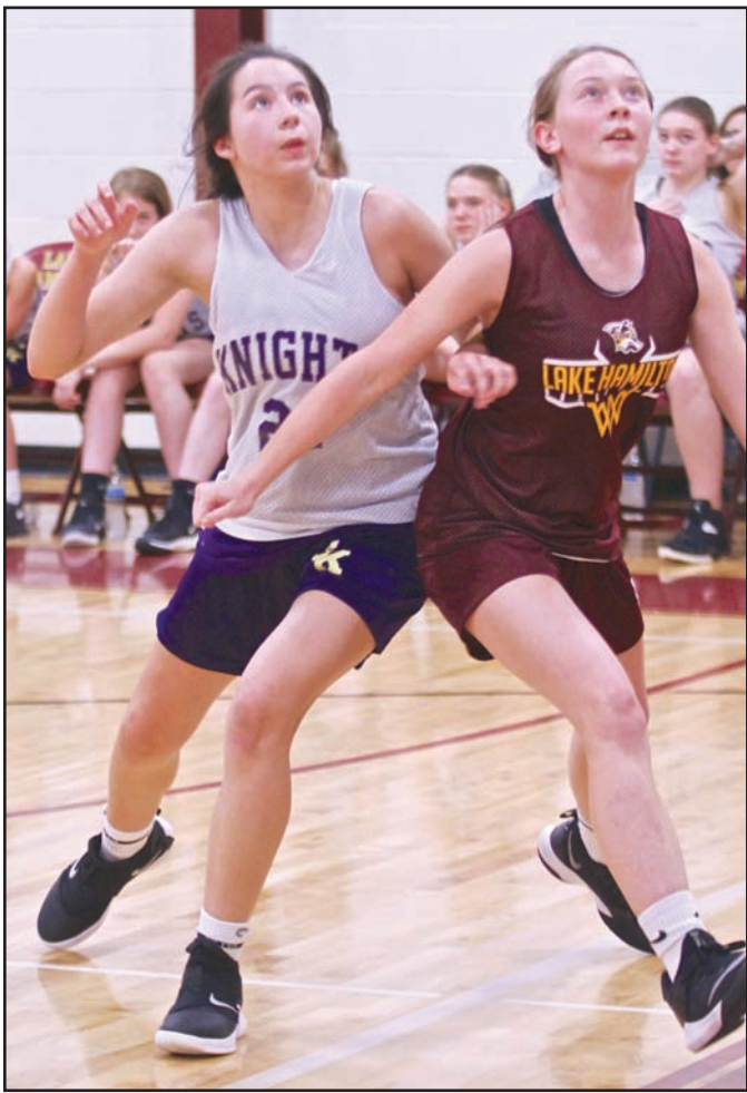
Centerpoint junior girls against Lake Hamilton

Each one have to understand each of the coaches will play their entire team members on the bench each day. These games help improve each players game and helps to improve a teams working together as well. They assist each coach with knowledge on what they what they have to work on the next school year. Fans and parents have to understand one of the best ways to improve and players and teams game is to go up against a stronger teams. There is an old adage in sports that states "You are ONLY as GOOD as your COMPETITION." These camps allow teams to go up against teams that they will not play against in their regular seasons.