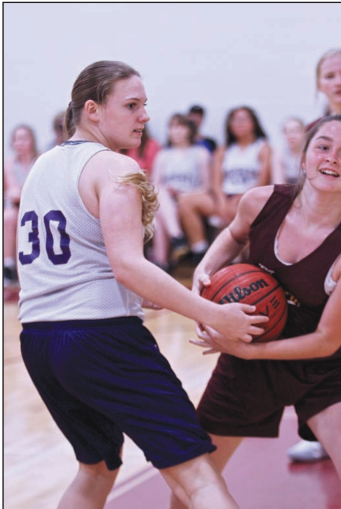
Centerpoint Junior Lady Knights (in white tops) against the Lake Hamilton Junior Lady Wolves