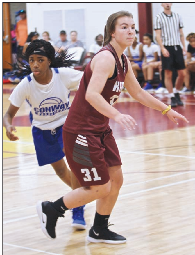
Kirby's Junior Lady Trojans played against Conway n the Lake Hamilton Tournament - above and at right