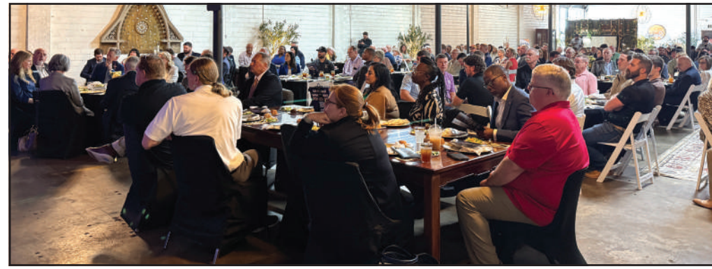
About 200 officials from 11 counties gathered at Midtown Social Friday, April 10, for State of the Southwest, hosted by the Southwest Arkansas Development Alliance.