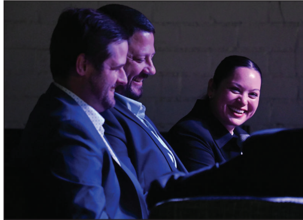
Industry leaders from Weyerhaeuser, Standard Lithium and Hostess Brands hold a panel discussion April 10 at State of the Southwest.