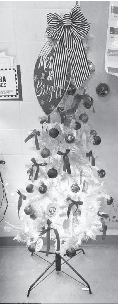
AN EAST CHRISTMAS ... Murfreesboro high school's EAST Rattlers finished their project Christmas tree, where students were asked to make a logo that represents their current project or skill.