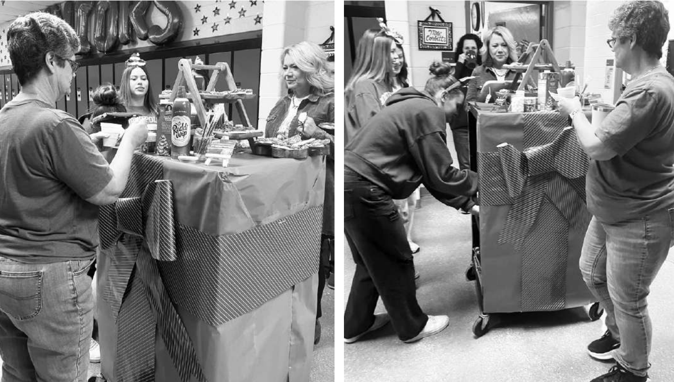
WARMTH AND CHEER... The Murfreesboro High School social media team spent a recent morning making the rounds with the “Christmas Cart,” delivering homemade cookies and hot chocolate to the school’s teachers, administration, and cafeteria staff. “It’s our small way of saying thank you for everything you do for us Rattlers all year long,” said a team representative.