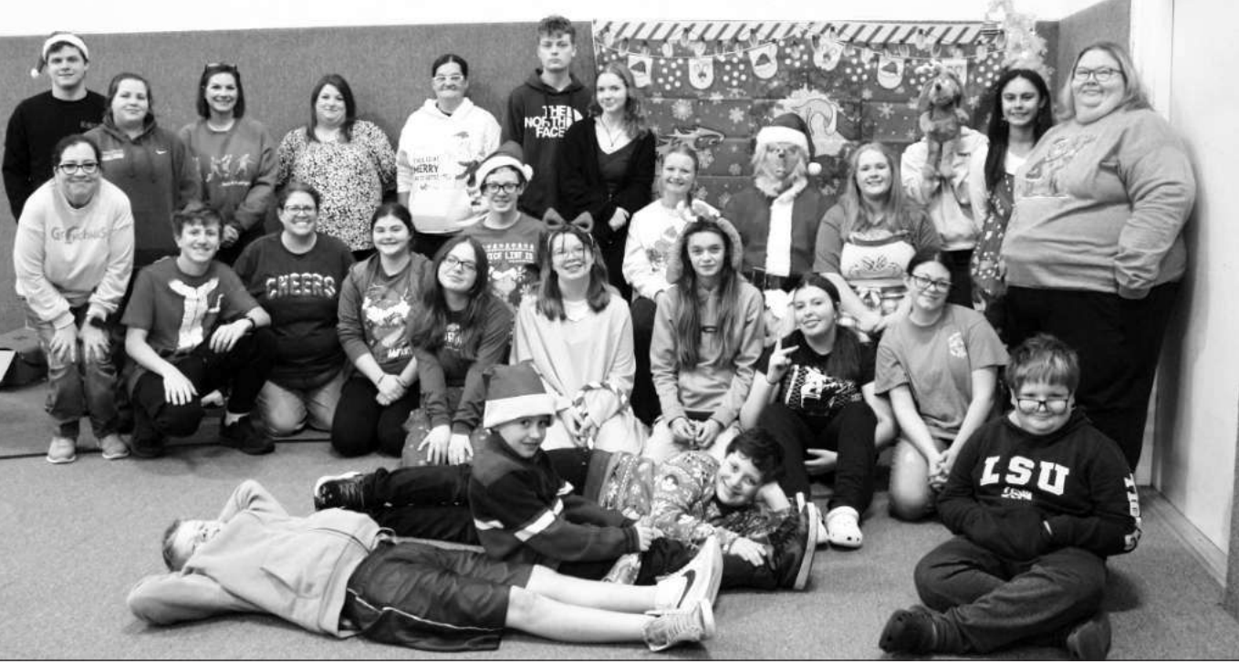
Submitted photos/MHS BAND MERRY GRINCHMAS ... The Murfreesboro Rattler Band Boosters held a “Breakfast with the Grinch” fundraiser on Saturday, Dec. 6 at First Christian Church in Murfreesboro. The menu included pancakes with sausage for the kids or a breakfast burrito options for the adults. Along with breakfast, there was also crafts/games set up for the attendees as well as pictures with the Grinch.